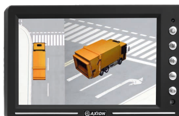
► View 2: Dual-Around view