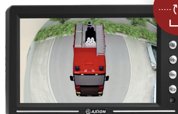
► View 3: Super rear view