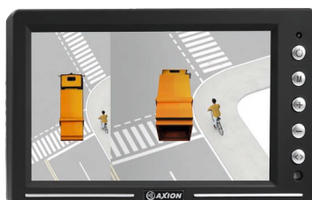
► View 1: Dual-3D